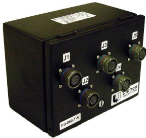
PARALLELING BOX (PB SERIES)