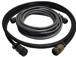
INTERCONNECTING CABLES (PPC, PBC AND IPC SERIES)

To operate the PS-94 Series converters in a system configuration, interconnecting cables are needed. The PPC, PBC and the IPC Series cables have been developed as accessory items. Unitron provides cables at different lengths or will provide hook-up information so that its customers can fabricate the cables on-site when lengths are not easily predetermined.