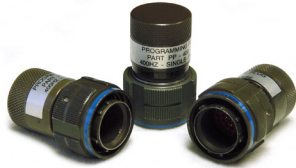
PROGRAMMING PLUGS (PP SERIES)