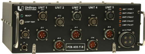
PARALLELING CONTROL BOX (PCB SERIES)