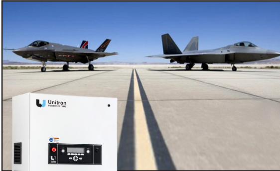
FIXED CONFIGURATION (Shown with standard digital panel and paint)