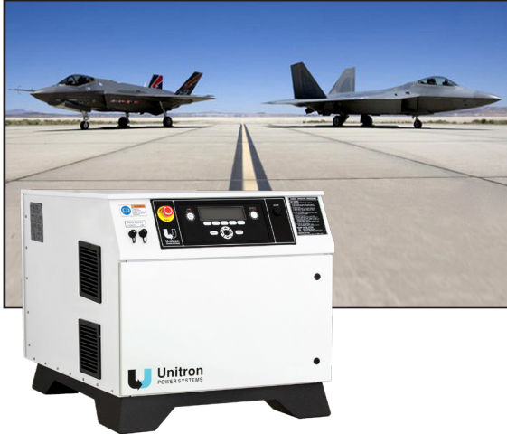
HORIZONTAL CONFIGURATION (Shown with standard 4 inch feet and digital panel)