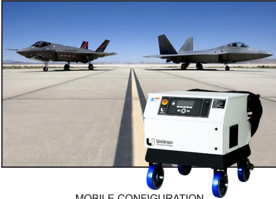
MOBILE CONFIGURATION (Shown with standard digital panel)