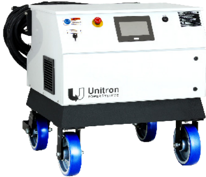
50/60HZ INPUT CONFIGURATION (Shown with standard touch screen panel)