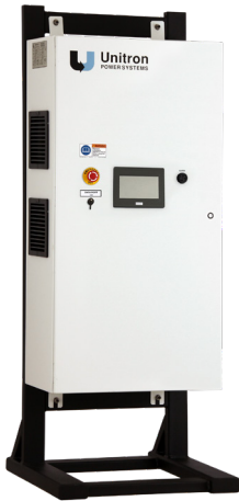
WALL MOUNT CONFIGURATION (Shown with touch screen front panel)