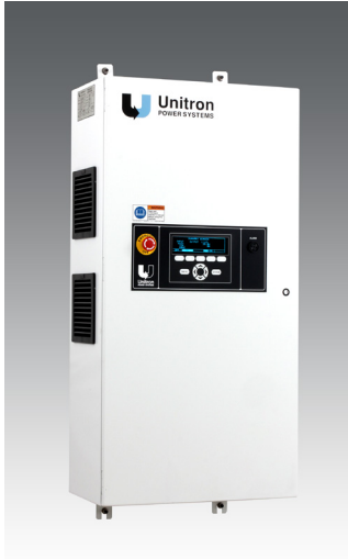
WALL MOUNT CONFIGURATION (Shown with optional digital front panel)