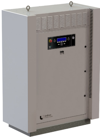
FIXED CONFIGURATION (Shown with standard digital front panel and optional privacy panel)