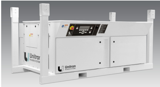
BOARDING BRIDGE CONFIGURATION (Shown with overhead digital front panel mounting)