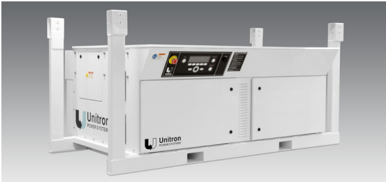
BOARDING BRIDGE CONFIGURATION (Shown with overhead digital front panel mounting)