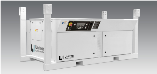
BOARDING BRIDGE CONFIGURATION (Shown with overhead digital front panel mounting)