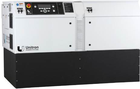
HORIZONTAL CONFIGURATION (Shown with standard 4 inch stand and digital panel)