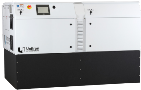
HORIZONTAL CONFIGURATION (Shown with optional 18" stand and standard touch screen panel)