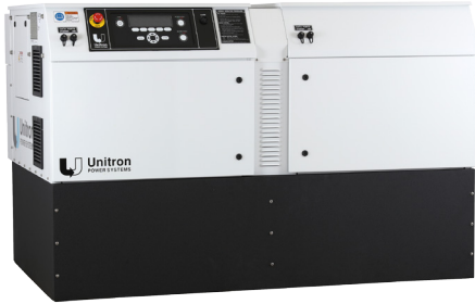
HORIZONTAL CONFIGURATION (Shown with standard 4 inch stand and digital panel)