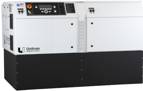
HORIZONTAL CONFIGURATION (Shown with standard 4 inch stand and digital panel)