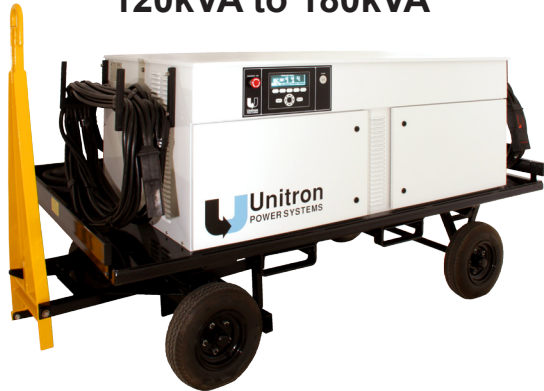
TOWABLE CONFIGURATION (Shown with standard digital panel)