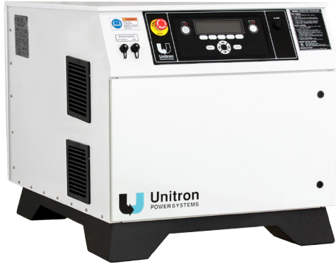
HORIZONTAL CONFIGURATION (Shown with standard 4 inch feet and digital panel)