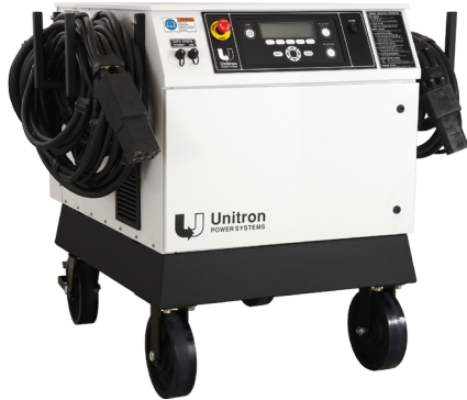
MOBILE CONFIGURATION (Shown with standard digital panel)