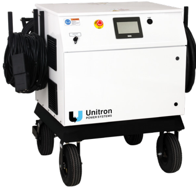
MOBILE CONFIGURATION (Shown with standard touch screen panel)