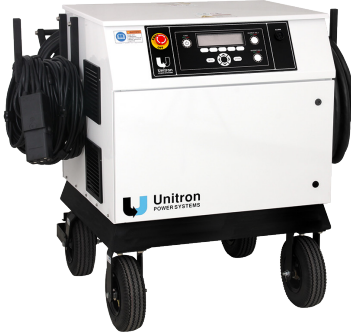
MOBILE CONFIGURATION (Shown with standard digital panel)