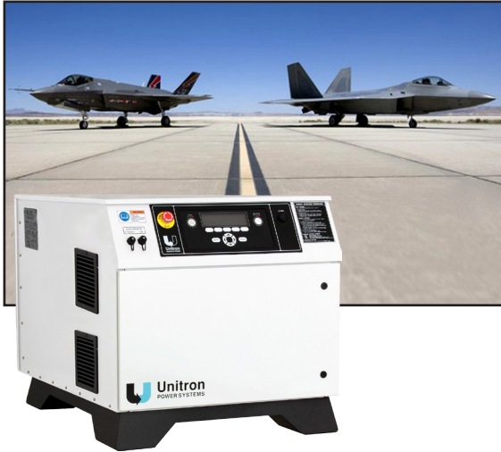
HORIZONTAL CONFIGURATION (Shown with standard 4 inch stand and digital panel)