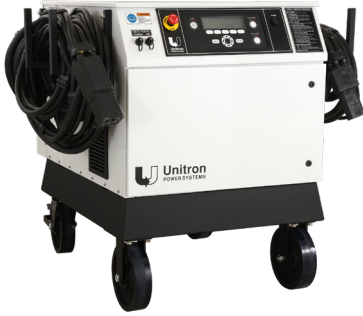
MOBILE CONFIGURATION (Shown with standard digital panel)