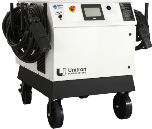
MOBILE CONFIGURATION (Shown with standard touch screen panel)