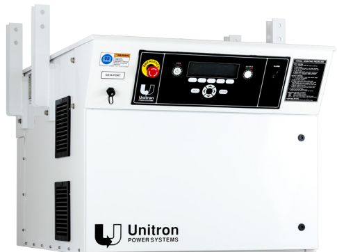
BOARDING BRIDGE CONFIGURATION (One of two modules shown above)