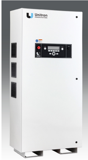
FIXED CONFIGURATION (Shown with standard digital front)