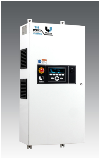
WALL MOUNT CONFIGURATION (Shown with standard digital front panel)