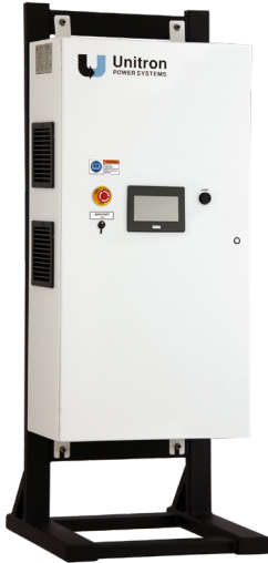
WALL MOUNT CONFIGURATION (Shown with optional vertical stand and standard touch screen panel)