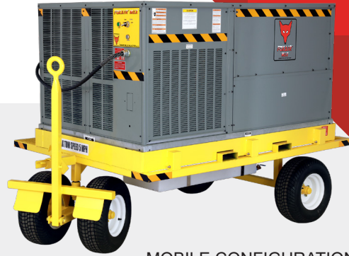
MOBILE CONFIGURATION (Shown in Trailer Mounted Configuration)