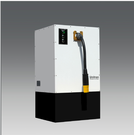
FREE STANDING (shown with optional 18inch mounting stand)

This product was manufactured in a plant whose quality management system is registered to ISO 9001:2008.