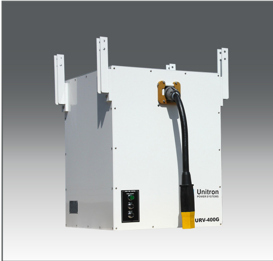
OVERHEAD MOUNT (Shown with unit interface bracket only)