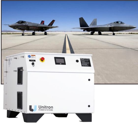
HORIZONTAL CONFIGURATION (Shown with standard 4 inch stand and touch screen panel)