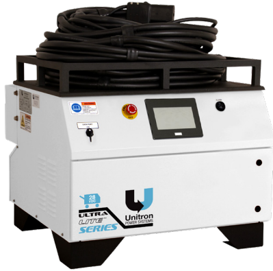
HORIZONTAL CONFIGURATION (Shown with standard 4 inch leg kit and touch screen panel)