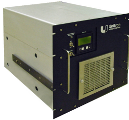
U.S. PATENT No. 6,178,101